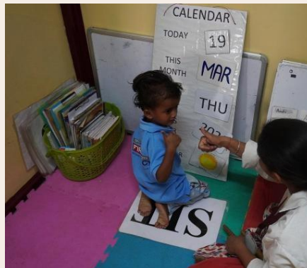
Calendar & structured learning