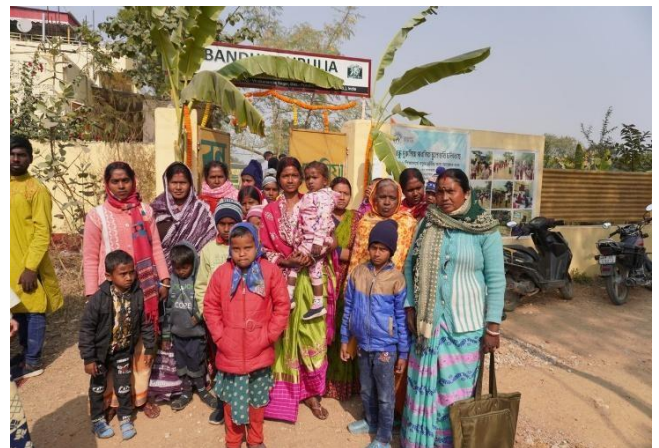
Reaching families at their doorsteps across rural Purulia