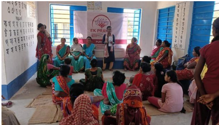
Awareness camp at ICDS centre