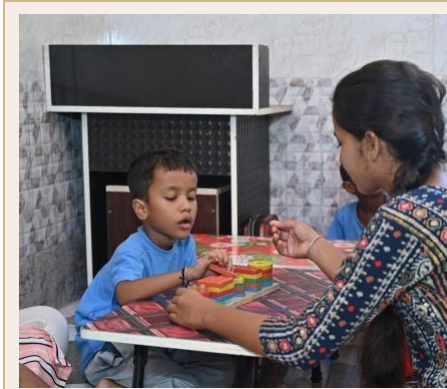
One-on-one learning session

Bandhu Purulia provides a comprehensive, child-centred array of services designed to nurture the full potential of every differently-abled child. Our highly trained staff work with each child individually to create personalized growth journeys.