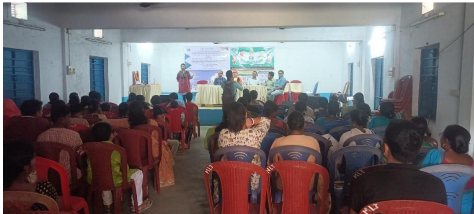
Awareness camp for ICDS Workers