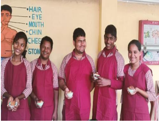
Pre vocational session at Bandhu Purulia

Bandhu Purulia recognizes that supporting a child with a disability requires supporting the entire family. We provide a robust ecosystem of services for parents, caregivers, and adults with disabilities — ensuring that families are empowered, informed, and never alone on their journey.