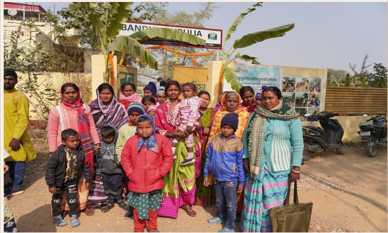
Families, children and community members at Bandhu Purulia — at our Vivekananda Nagar centre